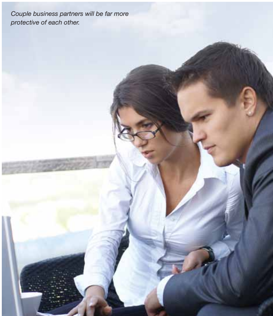
Couple business partners will be far more protective of each other.

I have seen this first hand as an advisor, where non-couple partners are willing to be quite critical of each other in front of me,